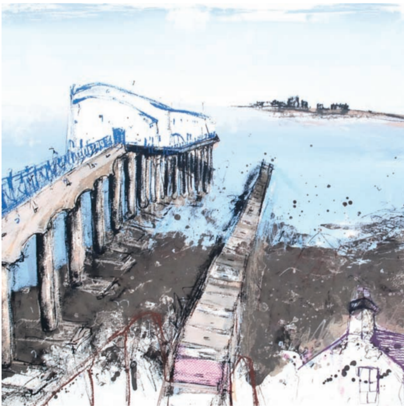
View to Piel Island | Kelly Stewart